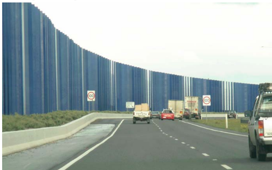
Blue Louvres Noise Wall in Melbourne