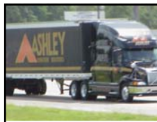
Guidelines for Vehicle Lane Restrictions in Texas