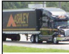
Guidelines for Vehicle Lane Restrictions in Texas