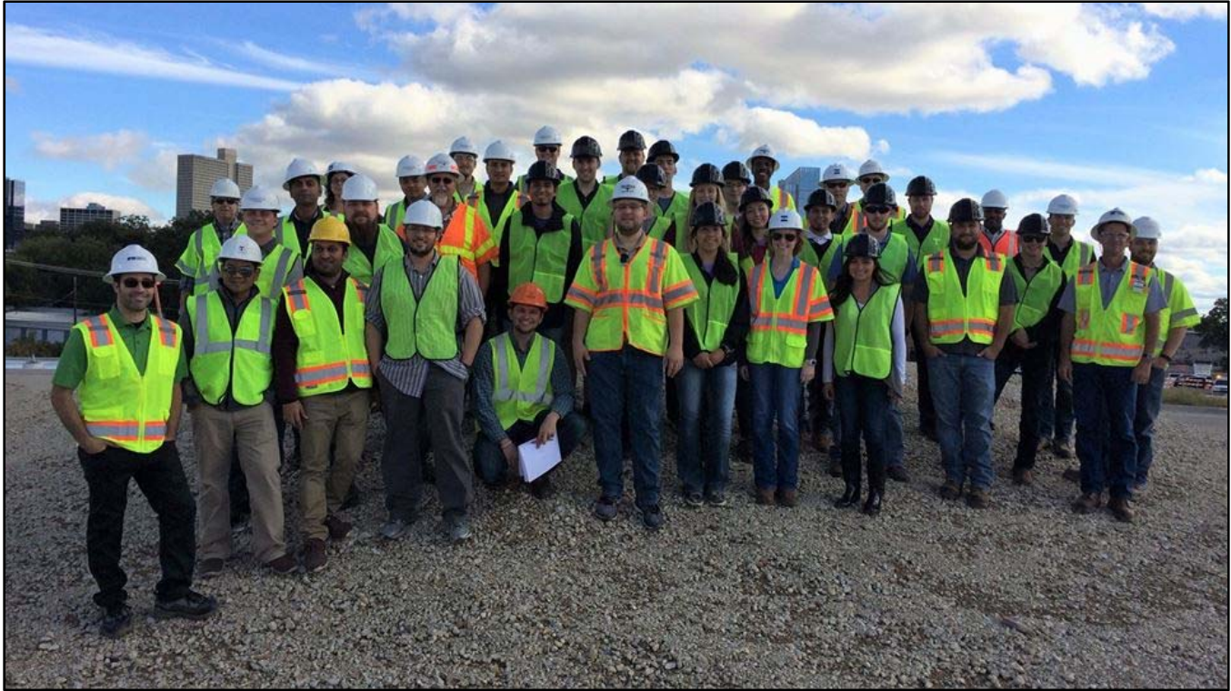
ASCE/ITE Joint Tour of the Trinity River Vision Henderson V-Bridge Project in Fort Worth