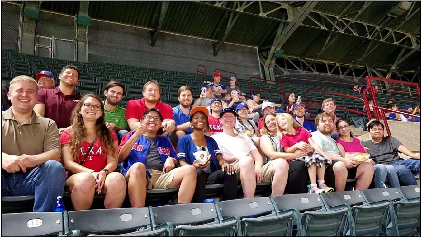
Younger Member Texas Rangers Game Outing