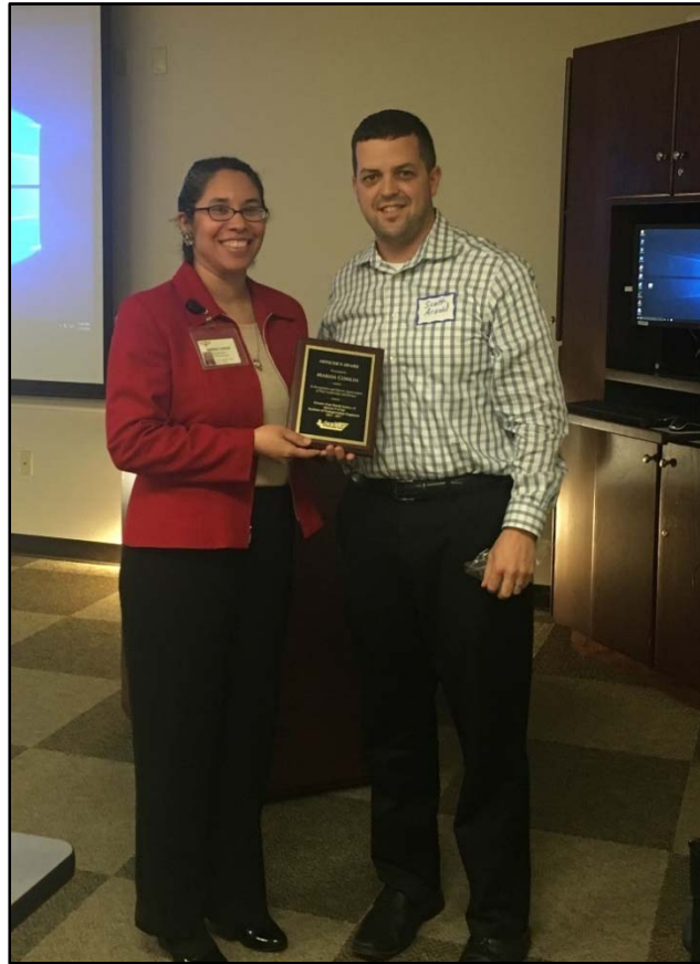
President's Award Presentation