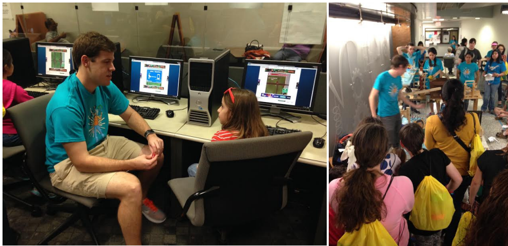
Our students helping during the traditional “Introduce a girl to engineering” day.

The ITE chapter once again volunteered and hosted an activity room to teach the girls about transportation engineering. Specifically, activities included traffic operations simulations and conversations about basic traffic operations and the importance of safe driving.