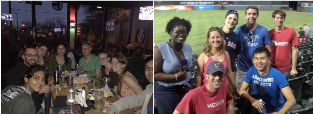
ITE members having a good time with the USIT interns.

As part of the Undergraduate Summer Internship in Transportation (USIT) program, in the summer of 2013 we hosted a group of top undergraduate students who are interested in pursuing graduate studies in transportation. Our chapter was in charge of helping and entertaining the interns with a variety of activities.