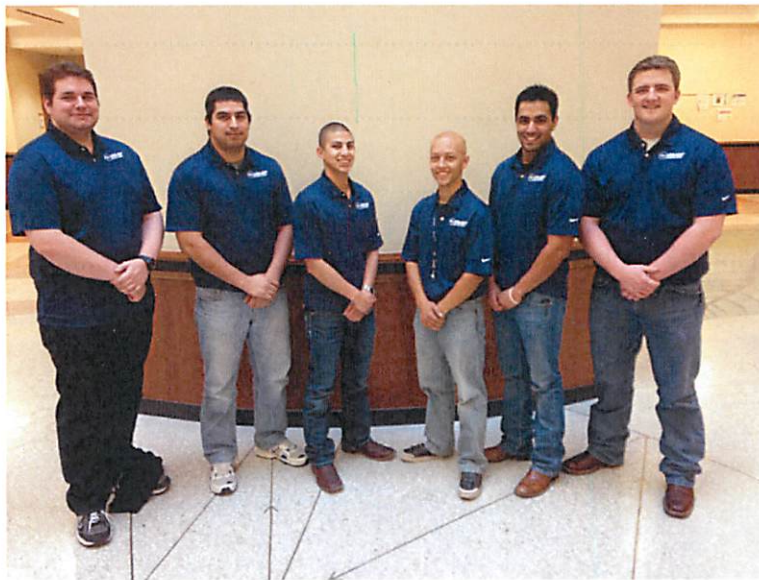
The UTSA ITE Student Chapter Officers