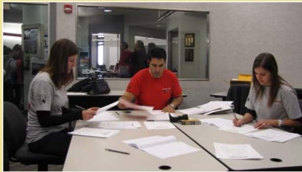
ITE and MathCounts Coordinator grading algebra exams

Another activity where ITE students volunteered, was the middle school mathematics competition (MathCounts), which took place at UTEP coordinated by the Texas Society of Professional Engineers. MathCounts is a national program that provides a competitive learning environment for students in 6th, 7th and 8th grade to experience academic achievements in mathematics. ITE members assisted this event