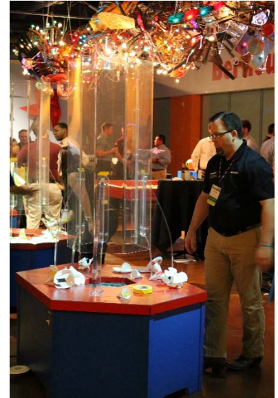
Thursday Night Social