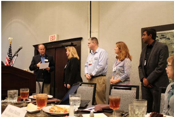
2017 District Officers