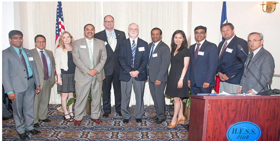
Below: TexITE leadership with the August 12th Joint Meeting panel of speakers