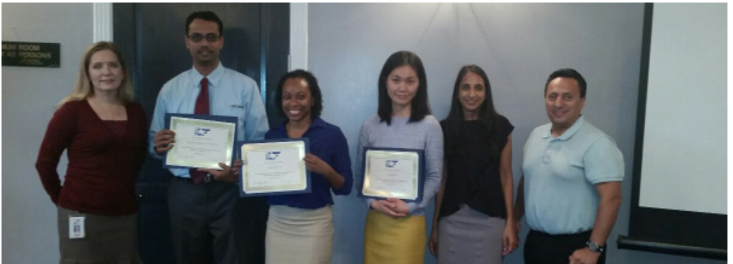
Above: At the December Business Meeting, 2015 Committee Chairs were recognized by the Section Officers.