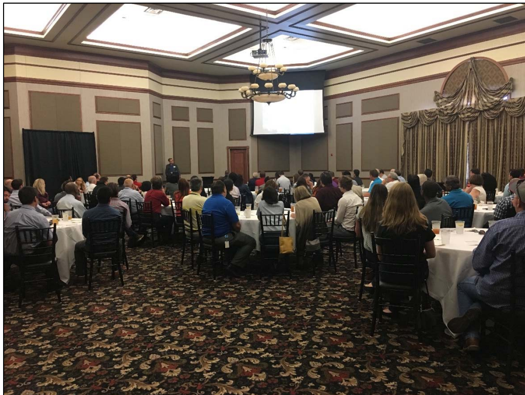
Dallas-Fort Worth TexITE Joint Mini-Conference