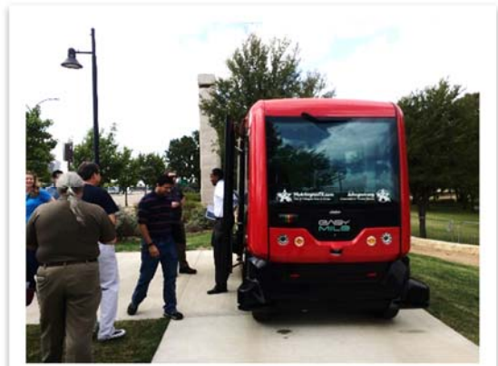
TexITE Dallas members get to know Milo, which started running this year on City trails adjacent to AT&T Stadium and Globe Life Stadium before and after Cowboys and Rangers games.